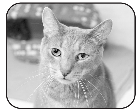
Corky, your Spokescat

My friends that have special needs don't let those issues keep them down. None of our kitties do! And we hope that you don't let any little differences keep you from letting them into your heart. Even if you cannot support them by caring for them at home, you can help keep them healthy and get them ready for the day when the right adopter comes to take them to their Forever Home.