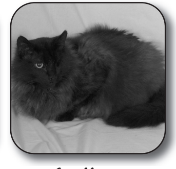
Husky Guillermo is a cuddly lapful of love who purrs on all cylinders. Let's get out the vote for Guillermo and give him something to purr about!