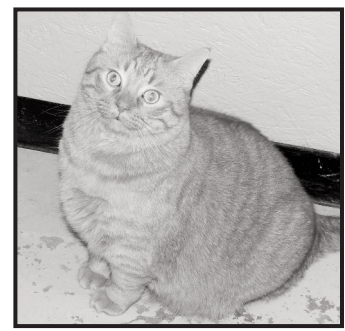
Garfield thanks all of our members for their support!

Please also take a moment to review our revised bylaws, which were also voted in at the November election meeting. The revisions help ensure that our organization can run more smoothly and efficiently, and you can review the changes for yourself at http://www.catsociety.org/about-ics/board-of-directors.