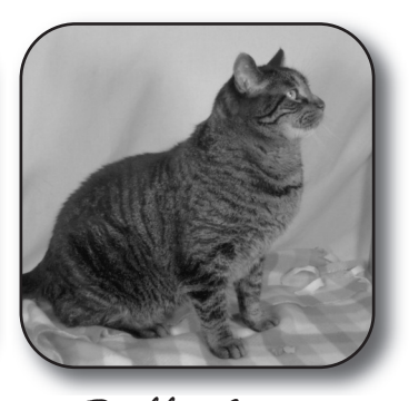
Bubba Gump One look at the rugged profile of this strapping guy and you can see why Bubba Gump's fans all said: Run Bubba, run!