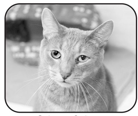
Corky, your Spokescat

"I've got an even better idea. Let's sponsor