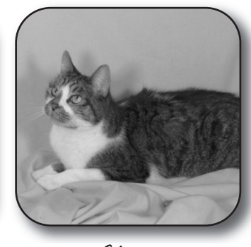
Endearing, quirky, and overall a totally cool cat, Chino is famous around the shelter for literally begging for his favorite treats. Don't make him beg for your vote!