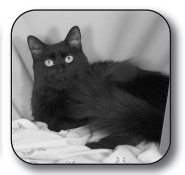
This lovely lass volunteered for the photo shoot and truly gave it her all. Show her you appreciate her initiative and her beauty and give Junco your vote and your heart!

Adoptable Cats, Upcoming Events, and more inside!