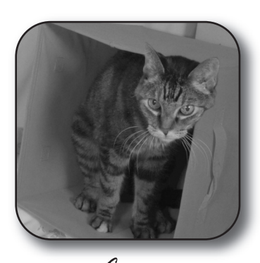
Such a precious face! Petite Aggie always enjoys a good conversation, but more than anything else would appreciate your support.