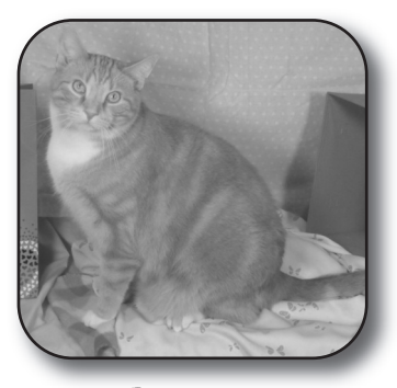
Pavarotti Just look into the eyes of this handsome and hunky fellow and you will hear music. Vote for Pavarotti and he'll sing for joy!

Please vote for the cat you feel is sweetest by donating in any amount in their name. You can vote via Paypal, by mail, or by dropping it off at the shelter. Voting will continue through the month of February and the winner will be announced the first week in March on the website, Facebook, and in the shelter, and will appear in the next Mewsletter. The glamourpuss who raises the most money will receive a bag of catnip and a new toy, so be a sweetie and vote for your favorite fabulous feline today!