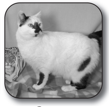
Smudgie We think that Smudgie is strikingly good-looking, just like he was painted by the loving hand of an artist. Express your artistic side and vote for Smudgie!