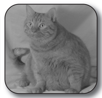
Garfield is a burly beefcake that will just melt your heart! He'd love a snack, but your vote would do just fine