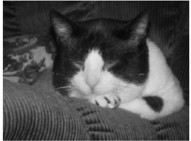
Frankie Blue Eyes snoozes peacefully in his easy chair.