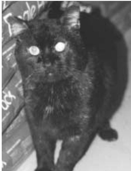
The angelic Seraphim

If you think these cats are suffering, visit them at the shelter. You'll see they have a warm and clean place to sleep, good food and lots of love and attention from our staff. Having a permanent home would be best, and we hope for that. Until they find homes, we make sure we meet all