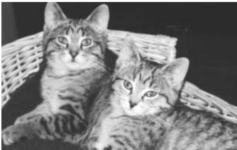
John Boy and Mary Ellen are a brother and a sister who were lucky enough to be adopted by the same loving guardian.

Even if you are home during the day, the attention a single kitten