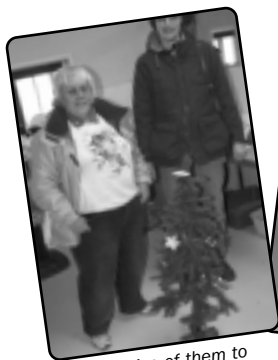
How nice of them to bring me a tree!