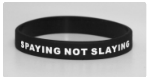
Spay and Neuter bracelets available for $3 each.