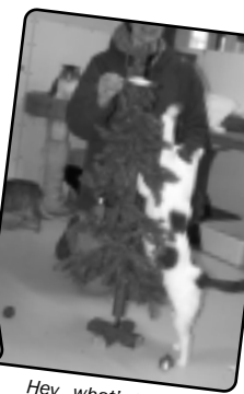
Hey...what's that way at the top?!