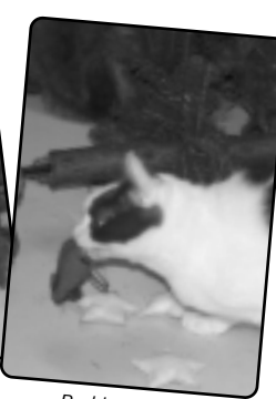
Buddy, you are sooooo mine!