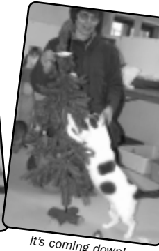
It's coming down!