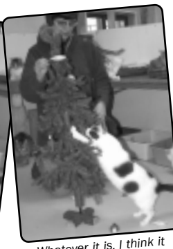
Whatever it is, I think it has my name on it!