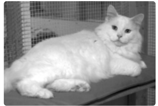
Dr. Regis, the Therapy Cat