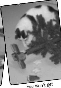
You won't get away now!