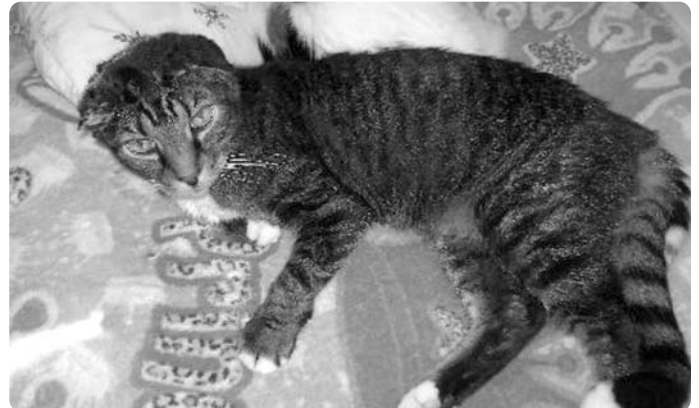
Grandpa could use a good home in his older years

Please come visit our shelter on any weekend from 10 to 4 on Saturdays or 1 to 4 on Sundays to meet some of our older cats. Or visit our website any time at www.catsociety.org to see pictures of some of our cats and see which one might be your new best friend.